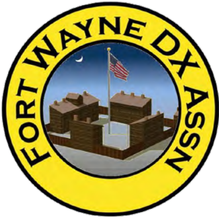
Carl Luetzelschwab, K9LA

The upcoming DXpedition to 3YØZ Bouvet in early 2018 is an important one to get worked and confirmed since it's currently #2 on the DXCC Most Wanted List at ClubLog: