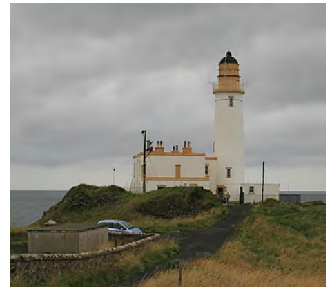
Turnberry Lighthouse ILLW UK0000