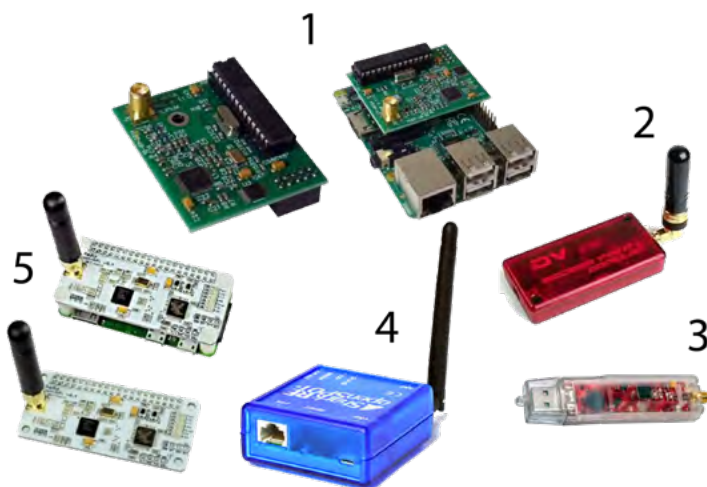
1) DVMega (by itself and mounted on a Raspberry Pi), 2) DVAP, 3) DV4Mini, 4) SharkRF openSPOT, and 5) ZUM Radio ZUMspot (by itself and on a Raspberry Pi Zero)

Photos of the more popular hotspots are in the figure below. The table below it includes tidbits of information I gleaned from the web on each of them. Accuracy is not guaranteed but web links are provided if you want more information. Ken AB9ZD