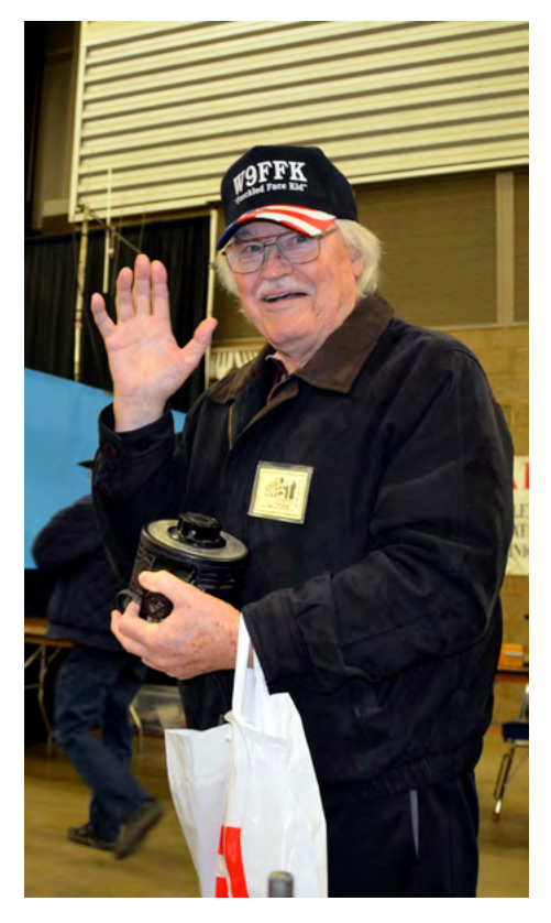
See You Next Year!