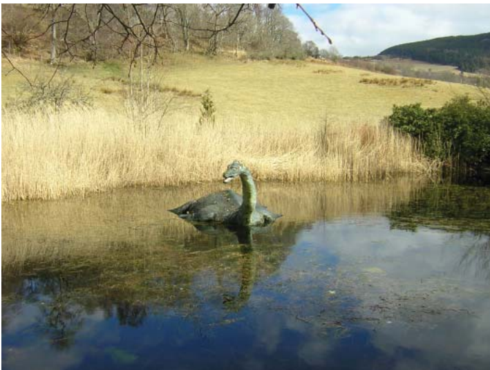
Is this Nessie? Nope – just a statue of her in a pond by Loch Ness

In summary, we had a wonderful time at the Convention, and also enjoyed our trip to the Scottish Highlands.