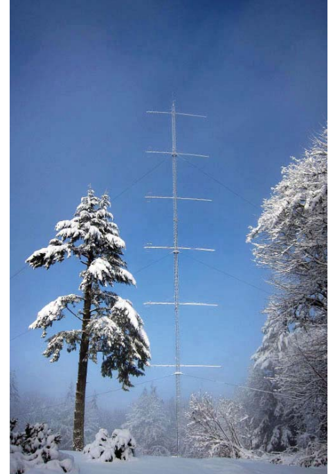
W7EW's 6m stack of six 7-element LFAs

The Allen County HamNews is prepared using Adobe's InDesign software along with PhotoShop and Acrobat on an i7 PC running Windows 7.